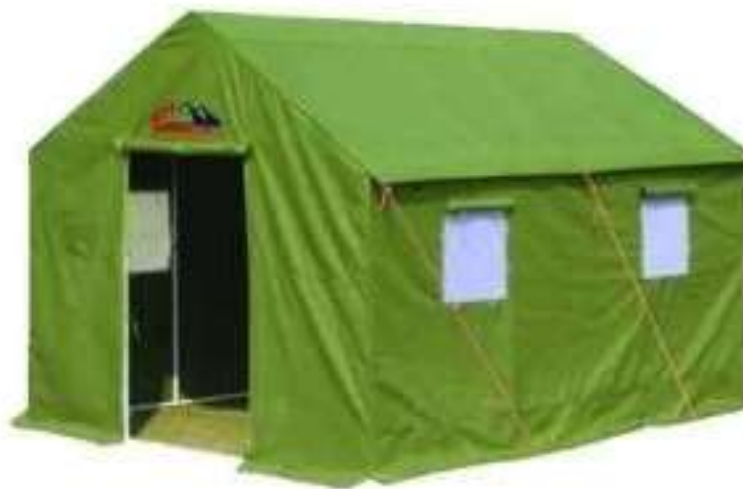
Picture : Shelter Tent

Considering the nature of the Covid-19 pandemic, NTT, has designed a 15' X 15' shelter tent (see picture) for the accommodation of 6 people with appropriate social distancing. In this tent, the 6'X3' beds can be set-up at the distance of minimum 3 feet (see layout design).